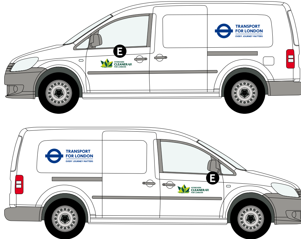
E Cleaner Air for London mark Width: 516mm