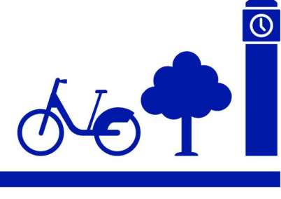
Fig 2 - monthly hires