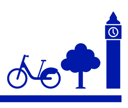
Fig 4 – most popular trips