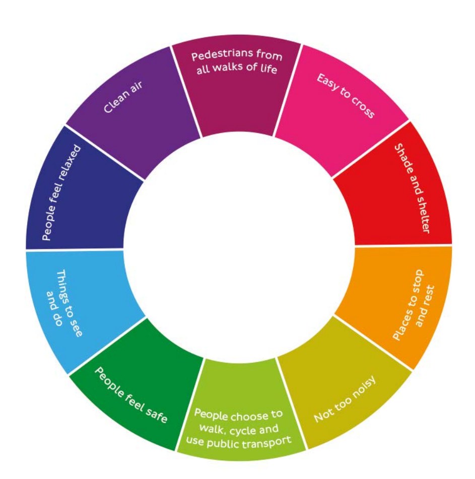
Figure 1 The 10 Healthy Streets Indicators