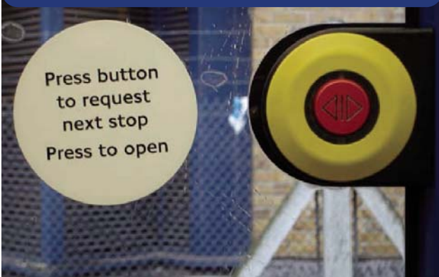
Press button to request next stop and to open door