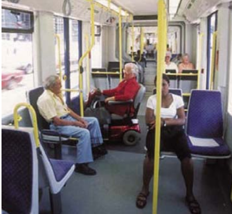
Find a seat or hold on tight