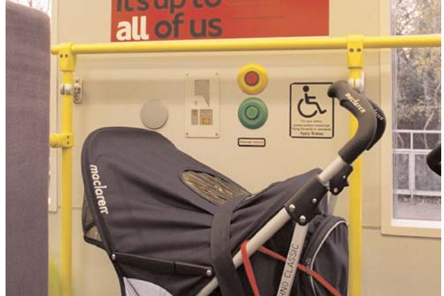
Respect areas for users who need more space