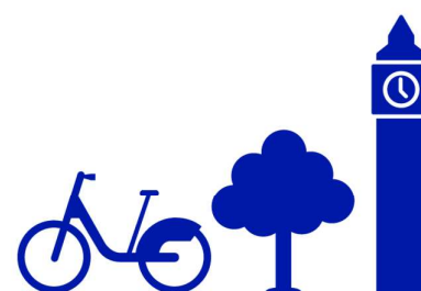
Fig 7 – Period dates