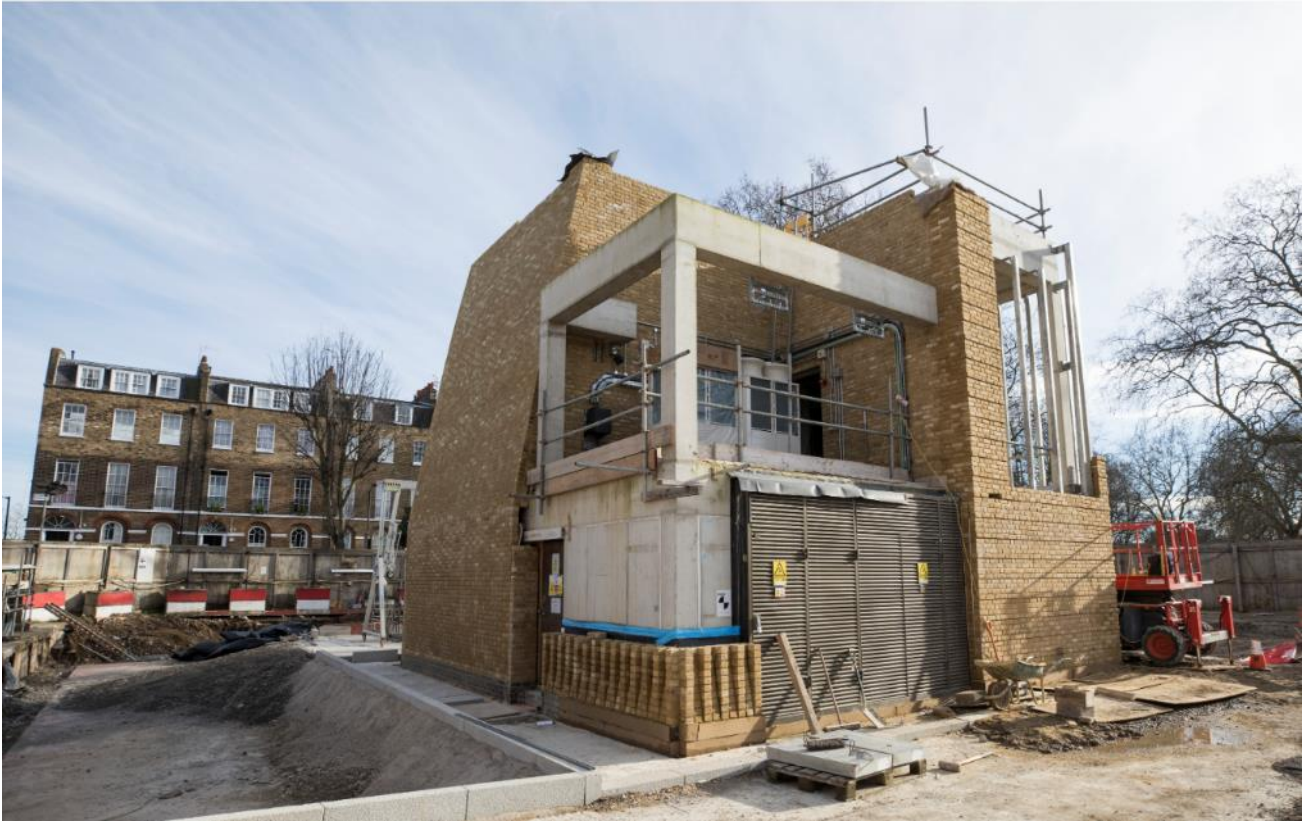
Varying angles and patterns make for complex brickwork on the headhouse façade

We've also begun the testing of some of the equipment and systems, including the ventilation fans. We'll continue to do this over the coming months as we prepare for trial operations to commence in the Summer. Some quieter elements of work below-ground will be conducted at night.