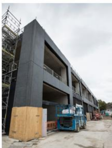
Fig.1 Stone cladding on the façade of the superstructure

In addition, glass fibre reinforced cladding (the white panels shown in fig.2 below) have been installed at the ticket hall entrance. The ceiling, made up of golden aluminium tubes, also illustrated in fig. 2 has provided the architectural finish to the underside of the canopy. Internally, the mechanical and electrical (M&E) team have been progressing throughout the four station levels installing vast amounts of containments and conduits to house the cable management system required to power the future station. (See fig.3 below).