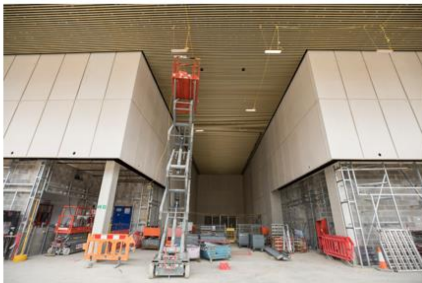
Fig.2 Reinforced cladding at the entrance of the station complete with golden tubular ceiling