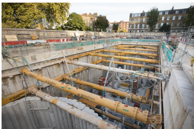
Fig. 1 Basement excavation and shaft at Kennington Park

October saw a big milestone in the project when the first engineering train crossed over the new Northern Line Extension tracks. (See fig.2 below). These trains are being used to deliver sections of rail to complete the final stretch of track installation between Kennington and the future Nine Elms Station, (we have completed 150m at the Kennington Park site so far). This operation is helping to remove a number of heavy lorry movements from the road network in the area.