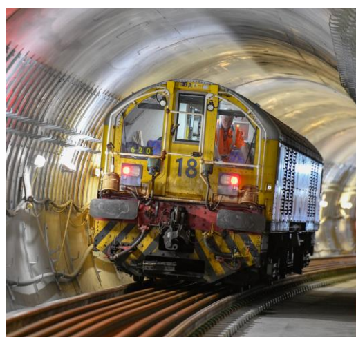
Fig. 2 First engineering train to cross NLE tracks