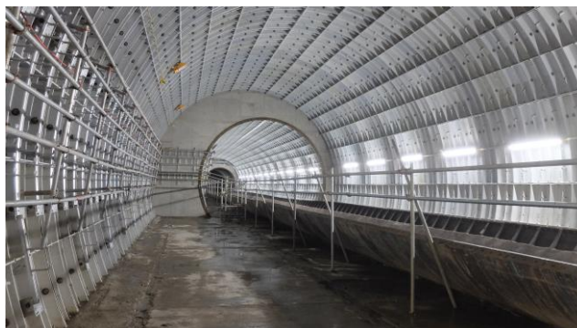
Above – remaining lower tunnel segments to be removed

Our working hours are now 24/7 to support tunnelling. This will continue until the completion of the shaft and tunnel in 2018.