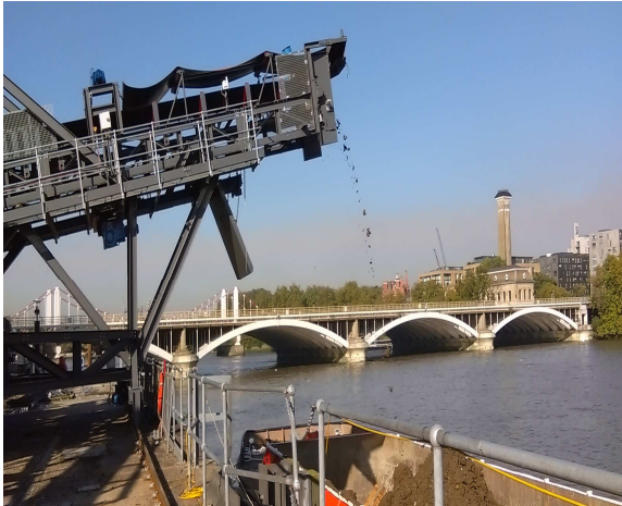
The muck-away conveyor system in operation by the