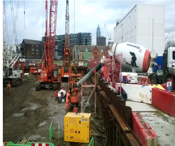
An example of a concrete pour taking place