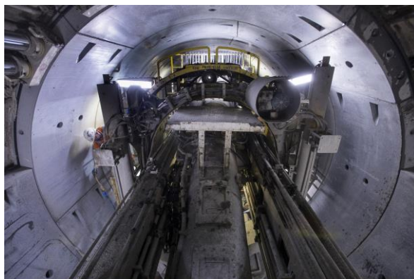
Above – inside the Tunnel Boring Machine

Working hours for tunnelling and surface tunnel support are now 24 hours/7 days a week . We do everything we can to minimise night time noisy works. This will include deliveries arriving to site between 07:00 and 20:00 Monday to Saturday and the barge movements 24/7 during the tunnelling period to remove excavated material.