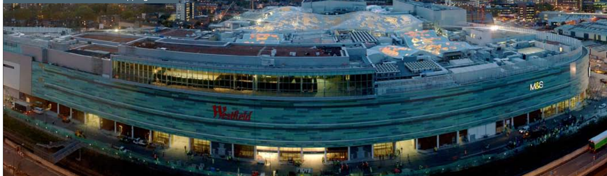
The new Westfield London shopping centre