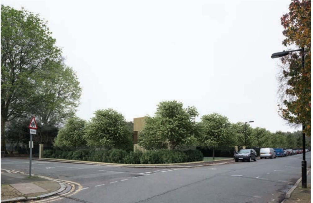
Visualisation of the corner of Kennington Park Place and St Agnes Place

To receive this document in large print, audio or another language please call 0800 298 3009.