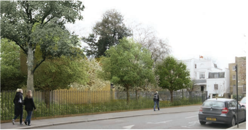
View from St Agnes Place

plate junction than the old lodge site. This increases the probability of having two or more trains in the same section of new tunnel not fully protected by the new tunnel ventilation system. This is not acceptable for health and safety reasons.