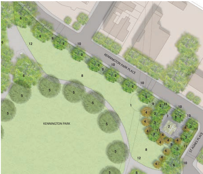
Kennington Park site plan showing landscape proposals