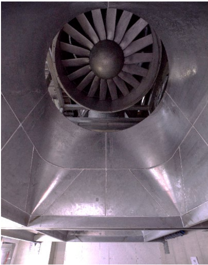
Figure 3 - Tunnel ventilation fan