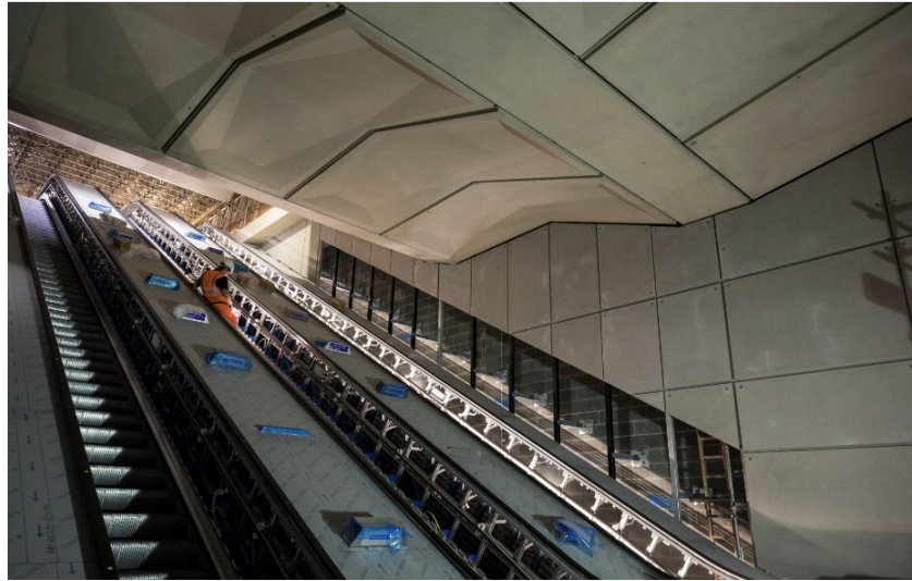
Figure 4 - Battersea ticket hall escalators and ceiling

We will continue providing written updates like this next year. If you are interested in taking part in a virtual Community Liaison Group one evening in January, please let us know by emailing nle@tfl.gov.uk with the subject line BATTERSEA VIRTUAL CLG. We will respond with further information in January.