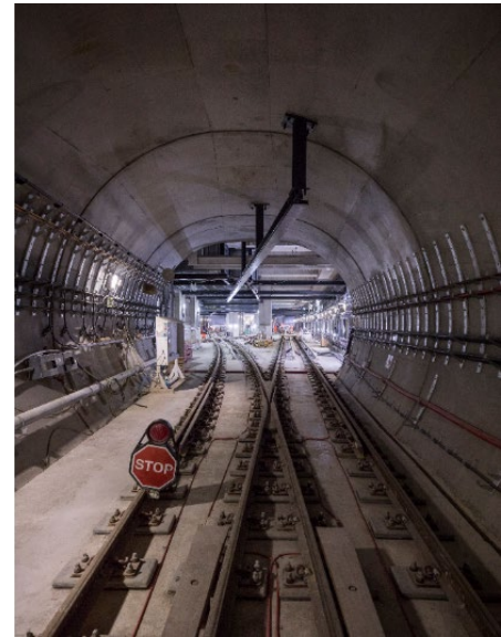
Figure 2 - Approach into Battersea Station

We appreciate that many more people have been working from home since March and we thank you for your continued patience whilst we continue to build the new station and supporting infrastructure. In recognition of the additional stress and anxiety this year has brought to us all, we have decided to take a 2-week break from construction over the Christmas period. Minimal activities will take place on site between the 18 th December and the 4 th January and there will be a much-reduced presence on site. You may however still see some personnel entering and exiting the site; they will be carrying out maintenance checks, inspecting the track or performing other test-related tasks.