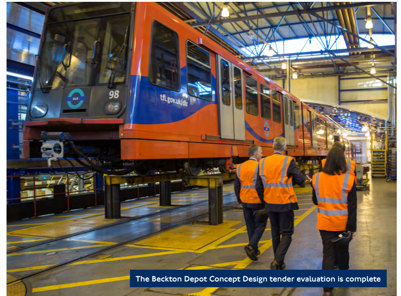
The Beckton Depot Concept Design tender evaluation is complete

Enabling works at DLR Limehouse station started on 20 January. The project will increase passenger capacity and ease congestion for passengers