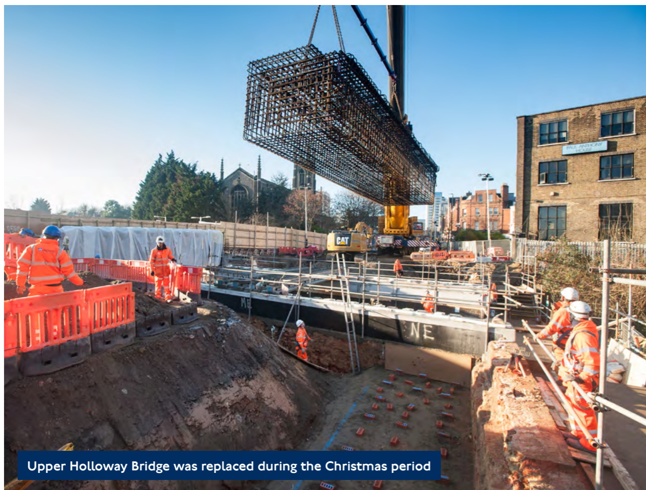
Upper Holloway Bridge was replaced during the Christmas period

Metropolitan Police and City of London Police, resulted in major maintenance works completing and Tower Bridge re-opening on 22 December – eight days ahead of schedule.