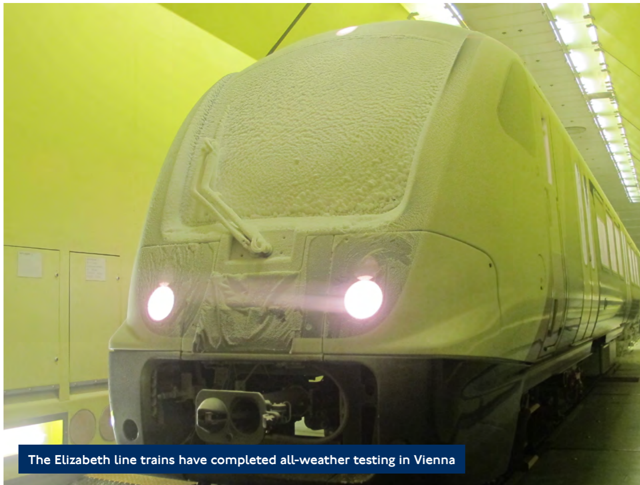
The Elizabeth line trains have completed all-weather testing in Vienna