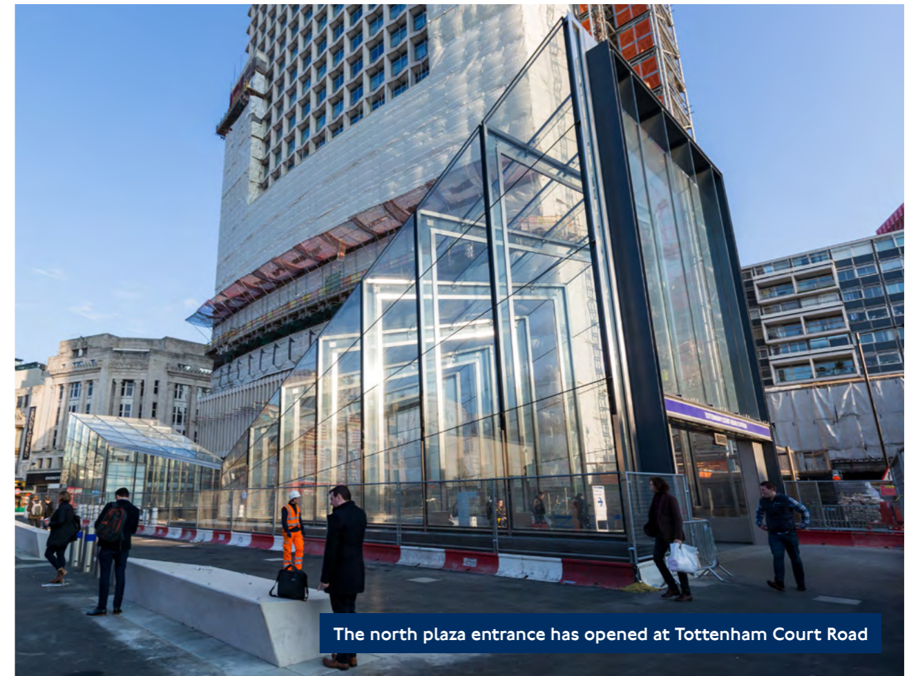
The north plaza entrance has opened at Tottenham Court Road

We completed the work on both lifts in 30 weeks. Replacing the lifts one at a time would have taken more than twice as long. Lift replacement in Tube stations is a lengthy process because of the restricted working space and the