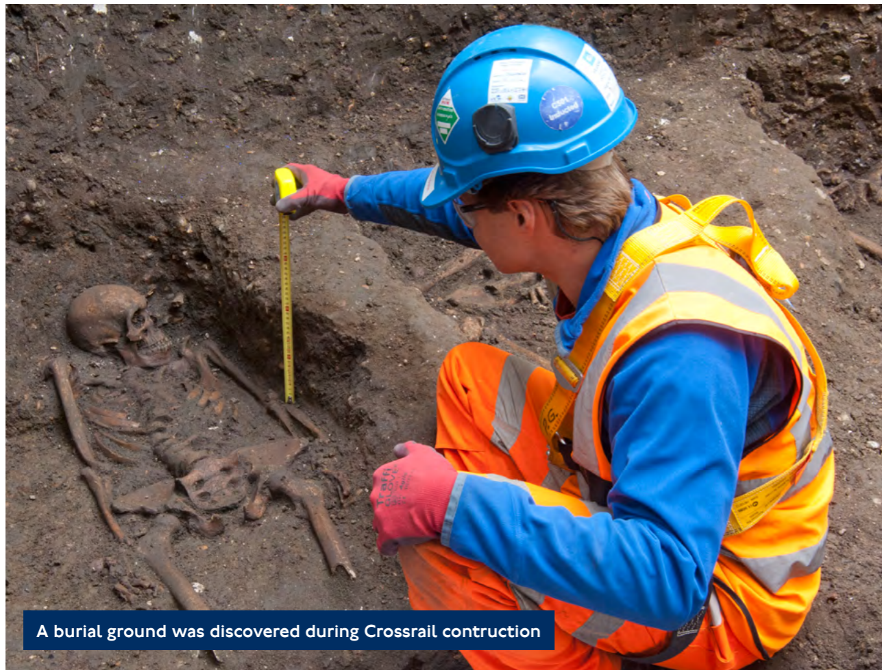
A burial ground was discovered during Crossrail construction

of west London, a Black Death burial ground at Charterhouse Square and the development of the Crosse & Blackwell food manufacturer in Soho.