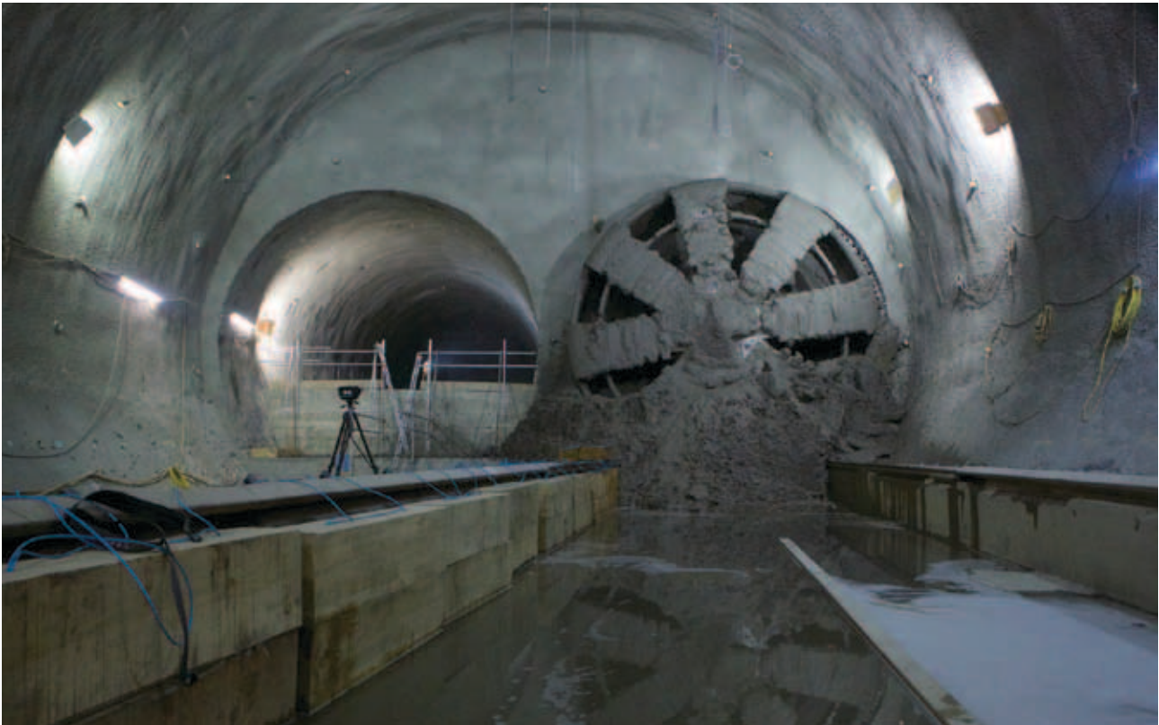
Elizabeth breakthrough at Stepney Green 7 November 2013