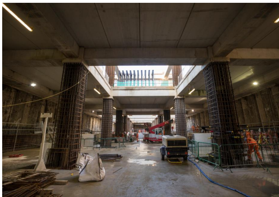
Reinforced column being prepared for concrete pour. (basement level -1)

In December all of the concrete slabs were poured to form part of the final flooring at basement level -2 within the future station box. The columns supporting basement level -1 have also been filled with concrete. (See image below). Over 80% of the pre-fabricated concrete beams that create the structural grid of the station have been installed at basement level -2.