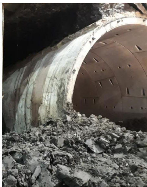
Demolition of the tunnel underway

At both the east and the west ends of the station, temporary works will take place in early February to support the ground that surrounds the tunnels. This is done by installing timber boards. Please note due to the nature of this activity and the need for continuity, these works will take place 24/7 throughout the month of February and early March.