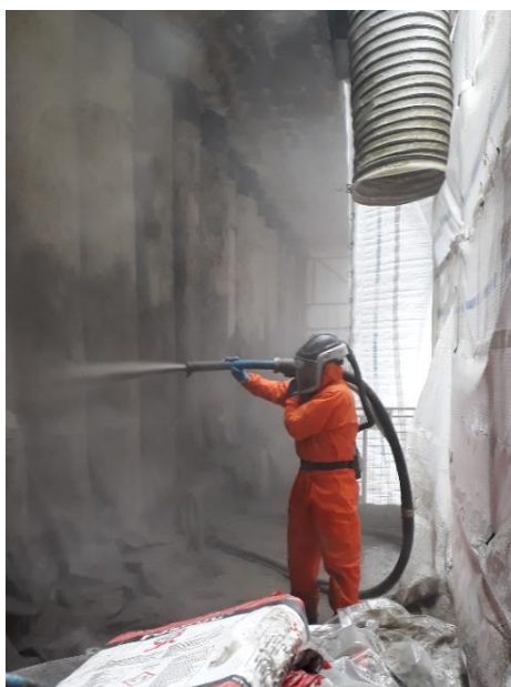
Application of sprayed concrete

The demolition will involve the use of a robotic breaker to split the tunnels into smaller segments. This material will then be lifted out of the station box by the gantry crane and transferred to lorries for removal by road. Please note that demolition is taking place below ground but may be audible on the surface. This activity is due to complete by the end of March.