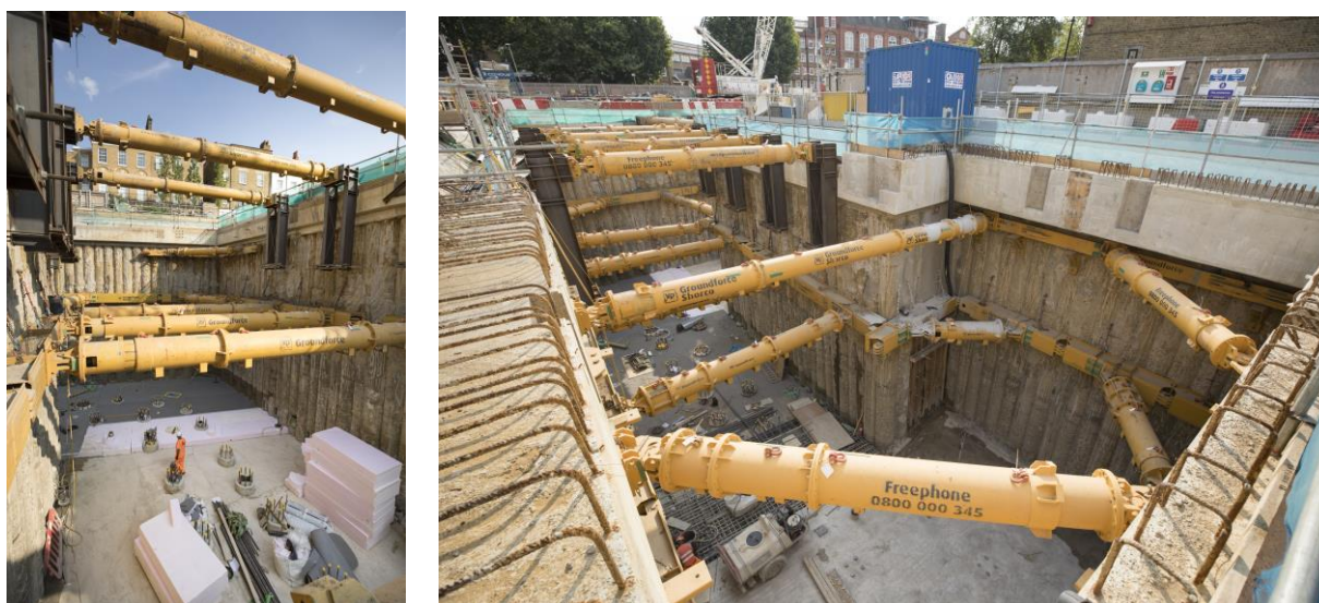
Above –Excavation of main site at Kennington Green July 2018

Big changes have been taking place at Kennington Green this summer. The excavation of the basement that will form the structure of the future KG Head House basement floor is now 11.5m deep (See images below). Thanks for your patience whilst we completed the cutting and breaking of the top concrete slab and foundations.