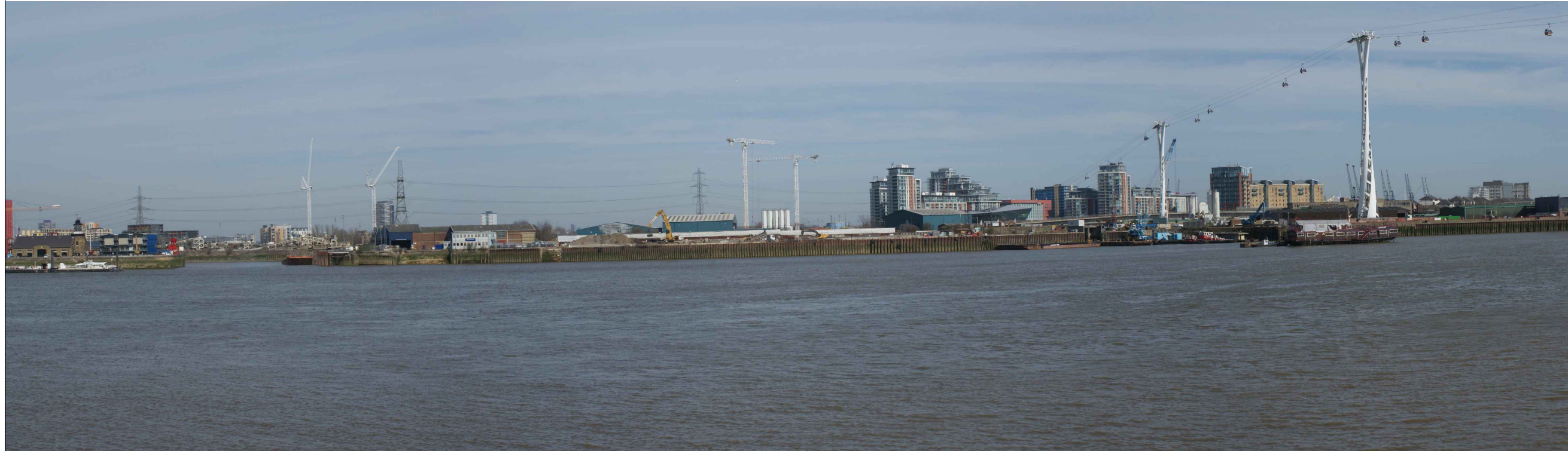
VIEWPOINT 4 - DAY TIME VIEW FROM THAMES PATH AT THE O2 ARENA, LOOKING NORTH EAST