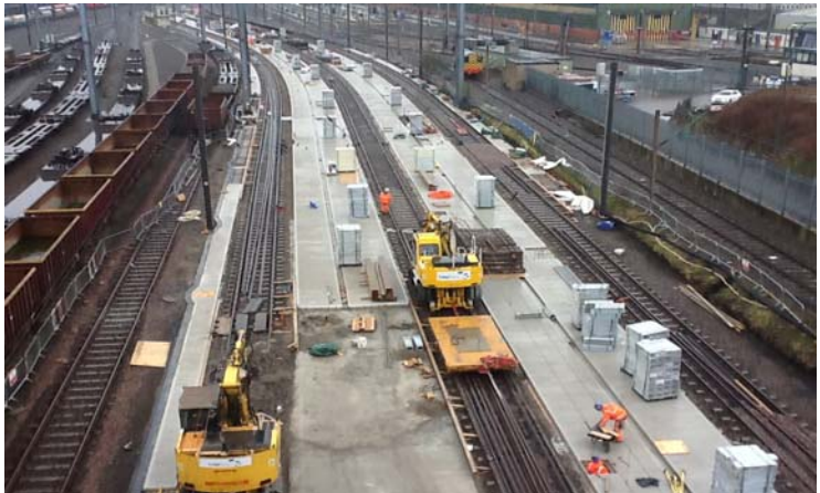
This project will upgrade the existing London Overground rolling stock to five carriages capable of selective door opening. The upgrade will include a number of infrastructure changes to depots and stabling, platforms, signalling and electrification.