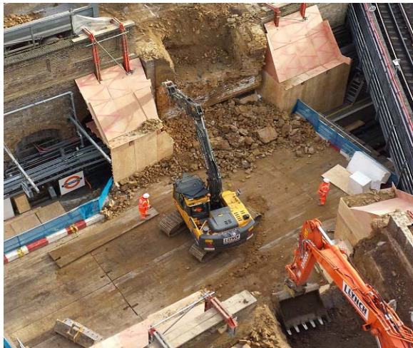
Whitechapel Station Winthrop St bridge removal

This project provides LU support and infrastructure protection to the Crossrail Programme delivered by Crossrail Limited (CRL). The vast majority of the expenditure is reimbursed by CRL.