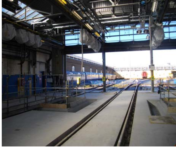
Ruislip depot shed conversion completed