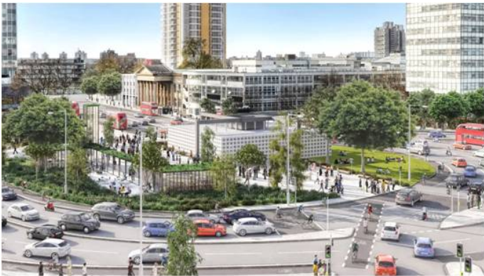
project is part of the Roads Task Force initiative to improve the poor performance of the roundabout. It will address safety issues, provide enhanced pedestrian and cycle facilities along with high quality urban realm, making Elephant & Castle a place not a traffic island.

This is a £600m portfolio to transform London's streets and deliver recommendations from the Mayor in response to the Roads Task Force. It will deliver major projects to improve the road network for all road users and support developments in key opportunity areas. In addition to Elephant & Castle Northern Roundabout, projects include Wandsworth Gyratory removal and Vauxhall Cross, which are at early stages of development.