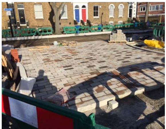
Lynton Road/Chaucer Drive in LB Southwark, part of Q1