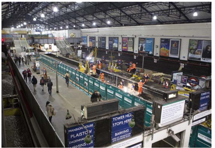
Track renewal at Earl's Court during a major closure

A well-managed infrastructure portfolio is the bedrock of our network. Maintaining asset condition not only improves reliability, it also allows us to carry out our capacity increases. We're doing this work in ever more efficient ways. This programme is renewing assets across the network, including over 1000km of track.