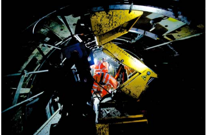
Baker Street to Bond Street crown replacement work

The Baker Street to Bond Street tunnel lining project will replace 215 metres of the concrete tunnel lining rings that are showing signs of deterioration on this section of the Jubilee line.