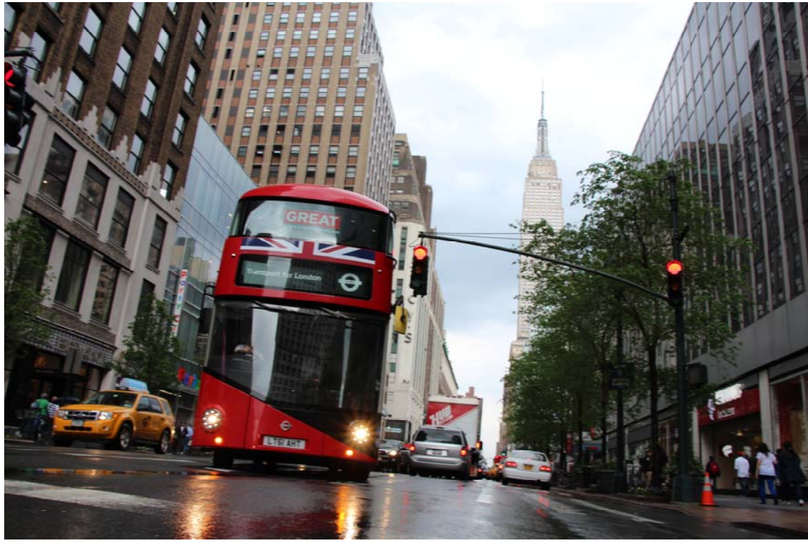
New Routemaster bus in New York