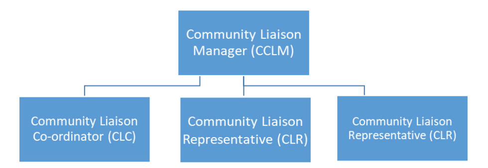
Figure 3. Community Engagement team