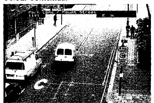
Colour Contextual After