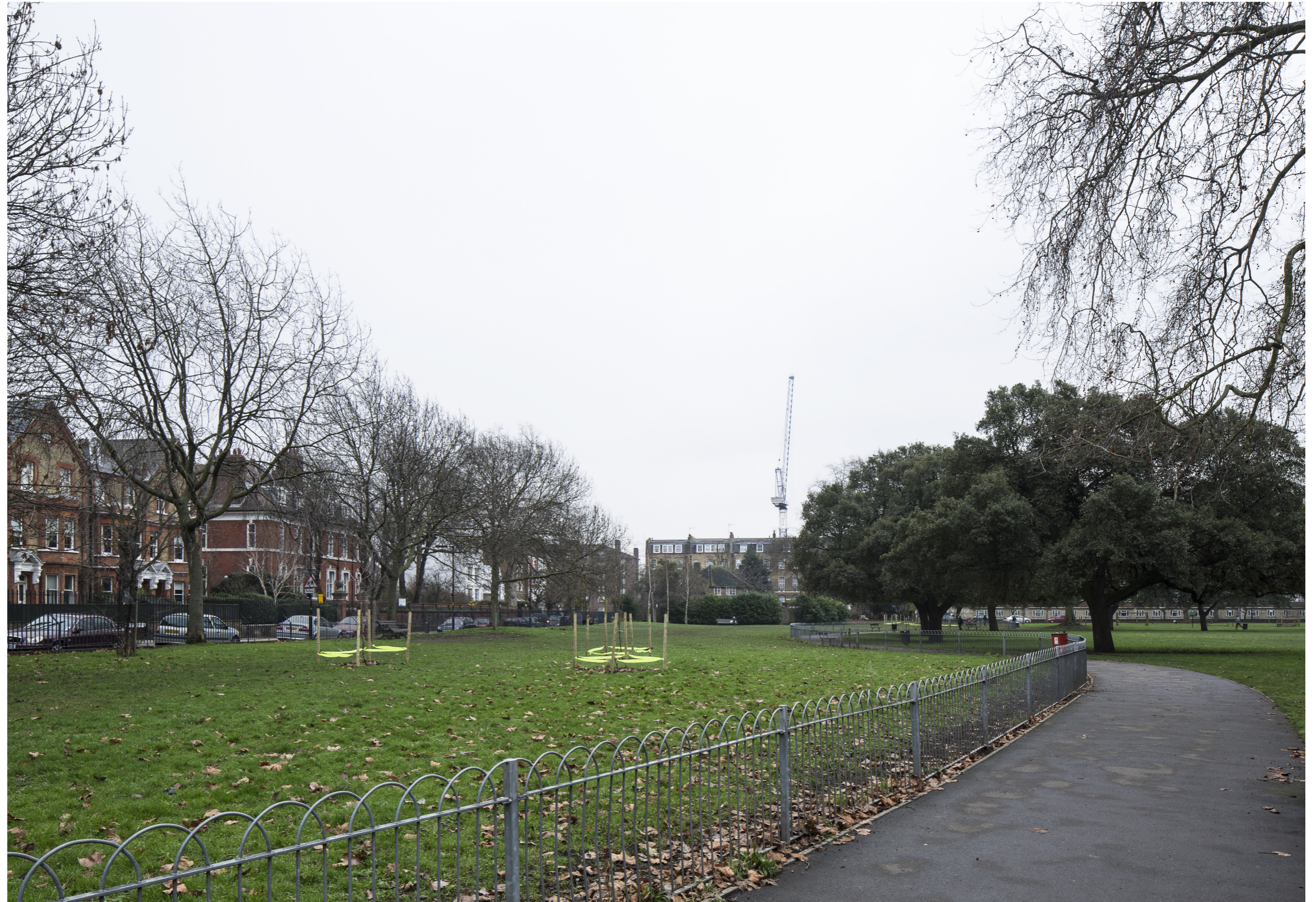
Figure 15 - 4

This view is from a point close to the war memorial at the north-western corner of the Grade II registered Kennington Park. The foreground comprises the beginning of a sweeping path which extends eastwards into the background. The foreground also takes-in a grassed, dog exercise area enclosed by railings to the north and a low bow-top fence to the south. This open area is lined by trees to the north which filter views of the two- to three-storey Victorian villas which front Kennington Park Place, some of which are listed. The background of the view includes the tops of earlier listed Georgian townhouses and the Kennington Park Lodge. The latter is substantially screened by dense vegetation within the lodge garden and park. There are also glimpsed views of the 20th century Conant House filtered by mature evergreen trees within the park.