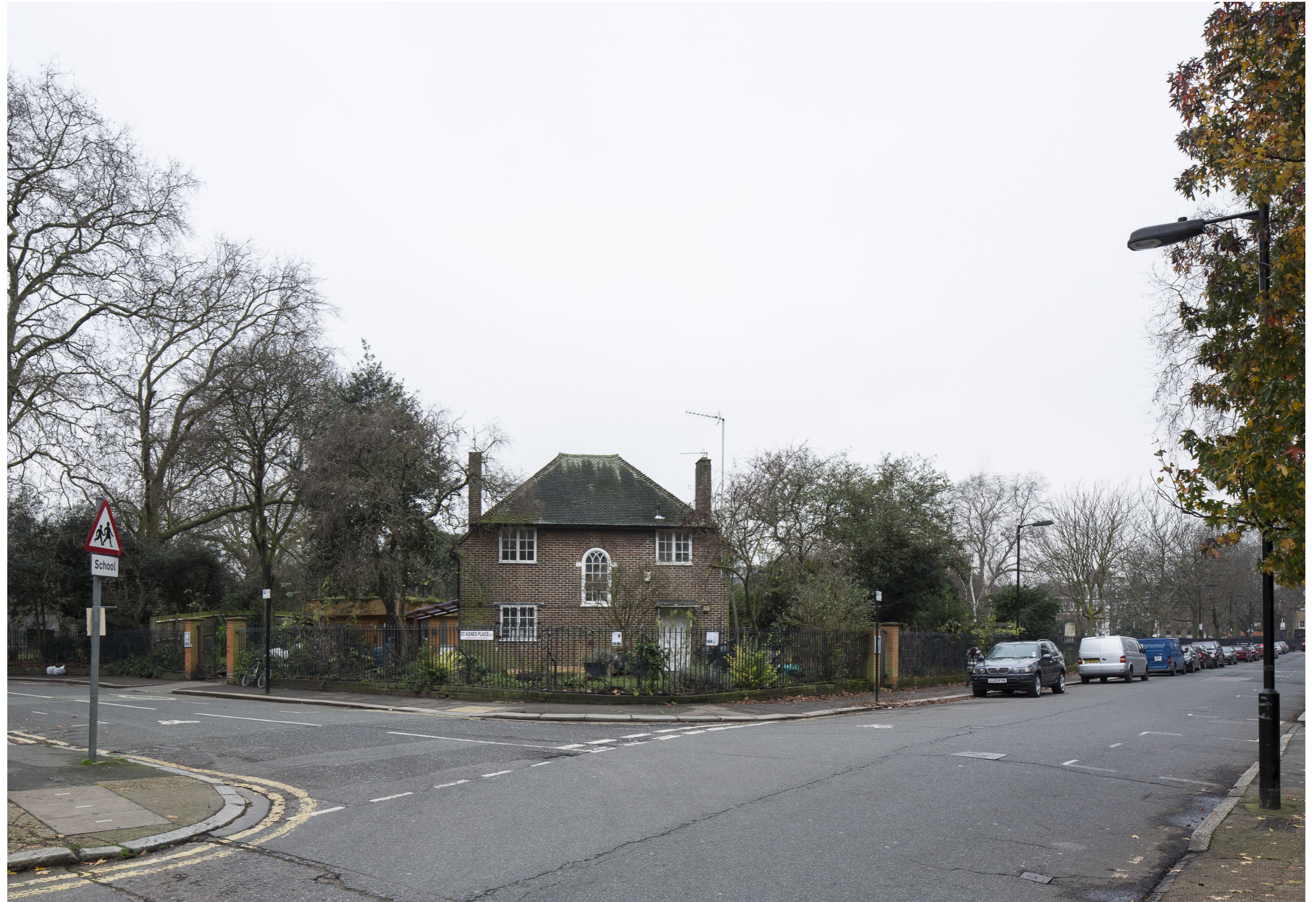
Figure 15 - 6

The foreground of this view is formed by the junction of Kennington Park Place and St. Agnes Place; residential streets are flanked by narrow pavements with granite kerbs. Kennington Park Lodge, an inter-war former park keeper's cottage, forms the focus of the view in the middle-ground. The modest two-storey house faces the corner of the street and is set within a garden enclosed by metal railings. Mature trees and shrubs form the background of the view, within the Grade II registered Kennington Park and to the rear of the lodge. The view to the west extends along Kennington Park Place as far as Kennington Park Road and takes-in the tree-lined northern boundary of Kennington Park.